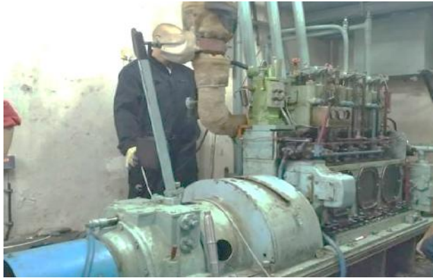
Figure 1. Diesel engine SKL3NVD24

The engine used is four-stroke, in-line, naturally aspirated. Piston stroke – 240 mm and cylinder diameter – 175 mm. The designation 3NVD24 indicates that the engine is 3-cylinder, N-means that the ratio of the stroke of the piston to the diameter of the cylinder – is less than 1.3. The letter sign V – indicates that the engine is four stroke and D – means that it is a diesel engine. The number after the designation is the stroke of the piston in centimeters. The SKL 3NVD24 engine was manufactured in 1965 at the Karl Libkner plant in Magdeburg in the former DDR. The SKL engine is shown on Figure 1. A hydrogen cell is shown on Figure 2.