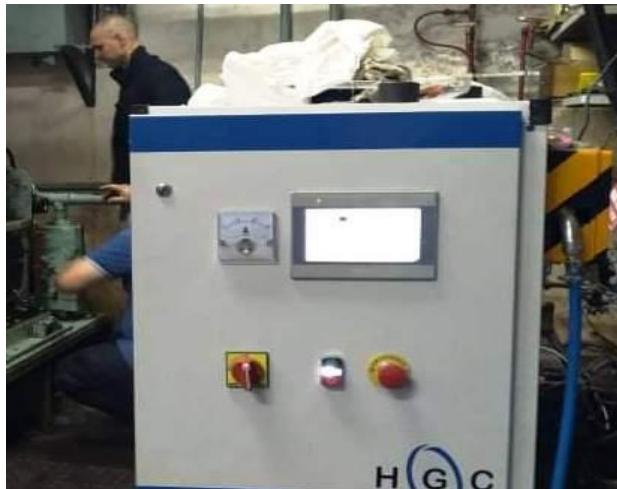
Figure 2. Gas generator