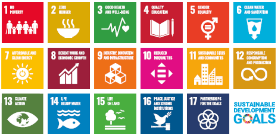
Figure 1. The Sustainable development goals 3)

comply with internationally relevant laws and to recognize fundamental human rights. The SDG industry matrix is built on these premises 4) .