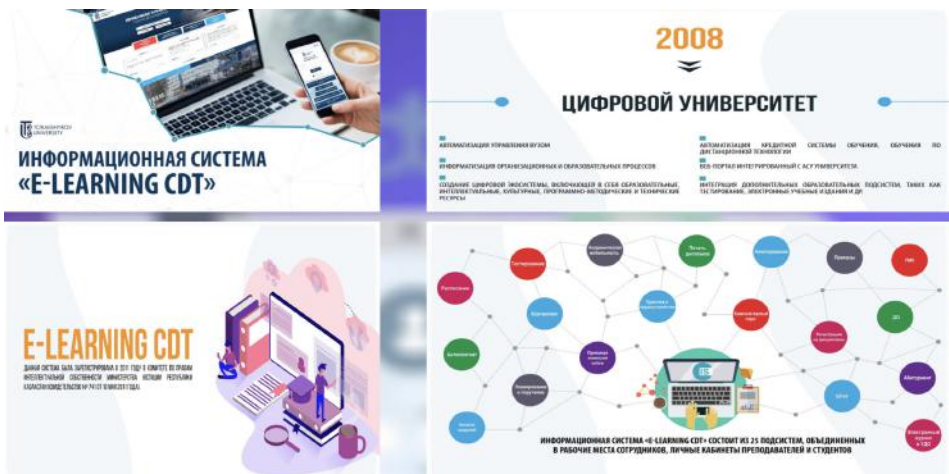
Figure 1. Information system e-Learning CDT

For example, under the guidance and co-authorship of the authors of this article, the e-Learning CDT Information System has been developed. e-Learning CDT contains 25 automated control subsystems, which include functions and services for automating university management, automating the credit system of education, distance learning, and informatization of organizational and educational processes. This system was launched at Toraigyrov University (Pavlodar, Kazakhstan) in 2008 and is currently the core of a digital ecosystem that includes educational, intellectual, cultural, software, methodological, and technical resources (see Figure 1).