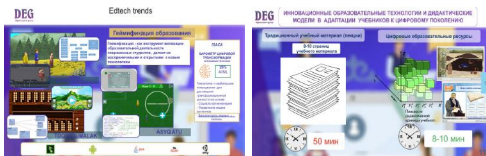
Figure 2. Research and Development of traditional educational material and digital educational resources (2011 – 2020)

As an example, for lecture material, which takes 50 minutes to read (in the volume of 8 – 10 pages of A4 format), it is possible to reduce the time for submitting material to 8 – 10 minutes by structuring and visualizing didactic learning units in digital content. Comparative infographics of traditional and digital educational content about the Kazakh language and fragments of the national games Kokserek, Togyzqumalaq, and AsykAtu are shown in Figure 2.