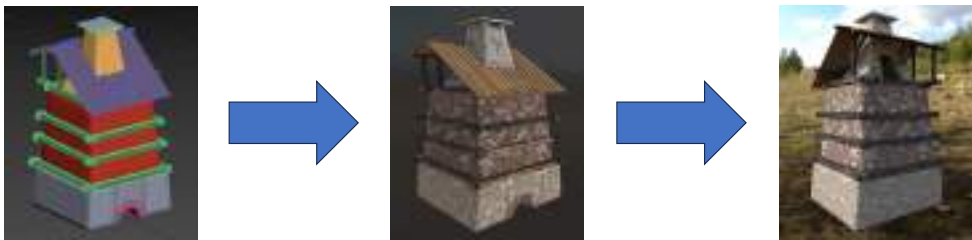
Figure 1. The modelling, texturing and rendering phases of the 3D modelling process

The development of 3D models in computer environments and using specialized software products and powerful computer platforms is known also as 3D modelling. The process itself can be divided in three steps – modelling, texturing and rendering (Fig. 1).