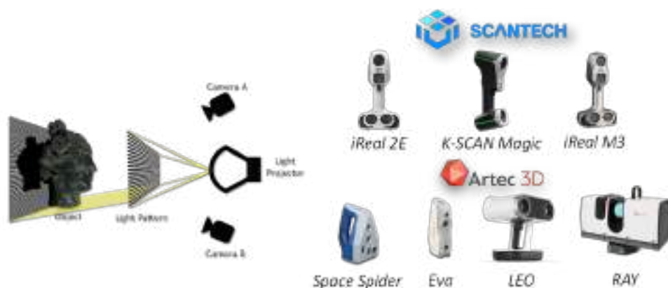
Figure 3. The principles of 3D scanning using structured light scanners (left) and a set of structured light and laser 3D scanners (right), which are used in the educational and scientific activities of the University of Ruse in Bulgaria

light scanners or using laser scanners (Fig. 3). The structured light scanners operate by emitting a grid of light with a specific pattern (Fig. 3), which then gets wrapped around the digitalized object. High-speed cameras on the scanner are then used to analyse the change in the shape of the light grid and to estimate the geometrical shape of the object. Unlike this method, the laser scanners employ laser emitter and rely on the popular laser-based range estimation algorithms to determine the range to each point on the surface of the object and then to reconstruct the geometrical shape of the object (Hristov et al. 2023).