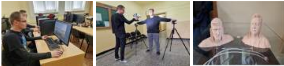
Figure 4. Erasmus students at the University of Ruse, studying the 3D technologies course and principles of the 3D modelling (left), 3D scanning (middle) and 3D printing (right)