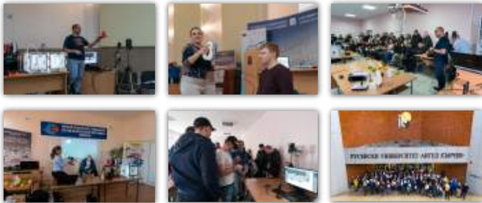
Figure 5. Moments from some of the recent workshops, seminars and trainings about the 3D technologies, organized by the Department of Telecommunications

To further spread the importance of the 3D technologies and to popularize them to the public, the Department of Telecommunications at the University of Ruse is regularly organizing local and remote workshops, seminars and trainings on the most interesting topics from the art of the 3D technologies (Fig. 5).