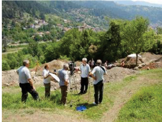
Fig. 5. Encyclopedia for the Curious: the TV crew