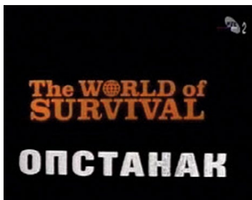
Fig. 8. Opstanak (Survival)

was synchronized in Serbo-Croatian: the text was read by actor (with a distinctive and refined voice) and radio presenter Dejan Djurović. The show dealt with wildlife and flora on the Earth, and biodiversity. It was zealously watched as part of school TV in technically equipped schools, and retold among students, teachers and parents. It dealt with teaching contents from the curriculum of Biology (6-7 th ).