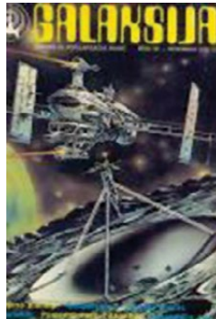
Fig. 13. Galaxy

Politikin Zabavnik is among the most popular magazines of the kind written in Serbo-Croatian; it can take pride in millions of copies as well as the same number of still regular readers, under the slogan “ Svaki petak izuzetak ” ( Every Friday an exception ).