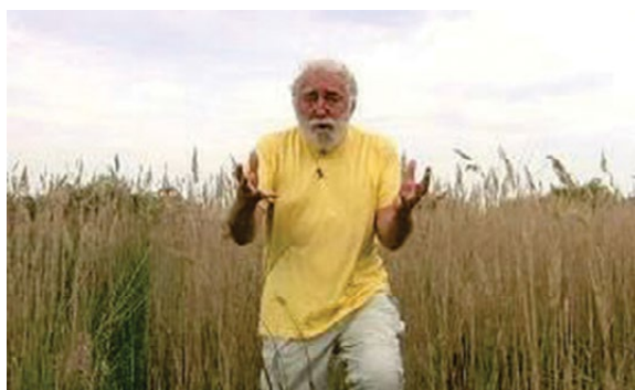
Fig. 9. Botanist David Bellamy

(2) Svet odiseja biljaka – World of Plants Odyssey (of French production) was broadcasted in the mid-80s of the 20 th century; it interpreted the origins and evolution of flora on Earth. It also dealt with the teaching contents from the curriculum of Biology at 5 th , 6 th and 7 th grades of primary school.