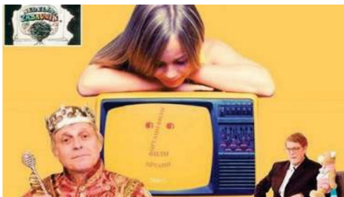
Fig. 1. School-educational and scientific program in former Yugoslavia

The shows broadcasted by former Yugoslav TV centers can be divided into: school-educational/educational, scientific/scientific-educational (scientific-popular) and cultural (music, film and fine arts, literature). On the other hand, according to whether they were intended for local audiences (all ages) or came from abroad (bought or exchanged among other foreign TV stations and production companies), they can be divided into shows of foreign and domestic production. They primarily dealt with teaching contents of life sciences: chemistry (geology, chemical technology), physics (engineering, astronautics and technics) and biology (ecology).