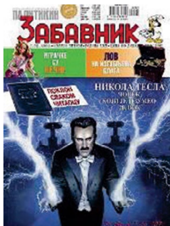
Fig. 12. Politikin zabavnik

Two most popular magazines for children, students and youth in the former Yugoslavia were: Politikin zabavnik – Politika's Magazine , and Galaksija – Galaxy (nowadays known as the magazine Planeta – Planet and Naši računari – Our Computers ).