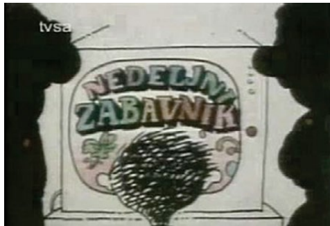
Fig. 6. Sunday Magazine

(4) Enciklopedija za radoznale ( Encyclopedia for the Curious ) is among the shows of the latest production of RTS within educational-scientific program (Fig. 5). It was broadcasted for approximately ten years, in the morning term on RTS1 and in the rerun term on RTS2, on working days. This show was designed as a little TV school encyclopedia for pupils, students and working people eager to know more about the lives of famous Serbian scientists, nature of Serbia and the Balkans, geography, history, literature.