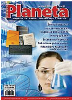
Fig. 14. Planeta

financed by the Ministry of Science and Culture of the Republic of Serbia. Nowadays it is no longer published under this name six times a year (bimonthly), but as the magazine Planeta (Fig. 14.), a magazine for science, research and discoveries, since 2003 (on a monthly basis – 53 editions so far). According to the opinion of the Ministry of Science and Culture of the Republic of Serbia, the magazine Planeta is a publication of special interest for science.