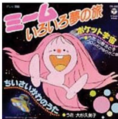
Fig. 11. Mimu - Jinnee, a little spirit

(4) Posle 2000 (Beyond 2000) , a show by Australian production from late 80s and early 90s of the 20 th century, was broadcasted by TV Belgrade within the summer and winter educational program (Fig. 10). This show dealt with futurology and latest scientific achievements. Several reportages were filmed in Serbia and Belgrade, which presented inventions and patents of Serbian scientists (new medicines in treating cancer and tumor, cosmetics and bio-materials) and inventors, where Yugoslavia was introduced as a country with “rich and prosperous future”.