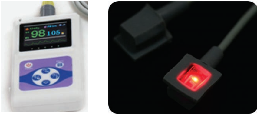
Figure 1. Pulse oximeter Contec CMS 60 D and a probe for the device