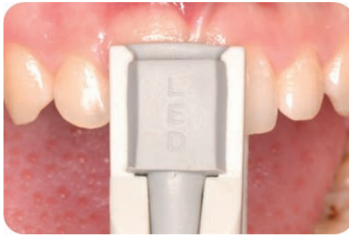
Figure 2. Positioning of the probe of a pulse oximeter on the tooth surface