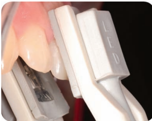
Figure 3. Direct application of the probe of a pulse oximeter on the tooth surface