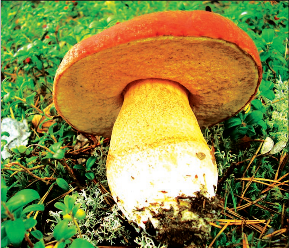
Figure 1. Boletus pinophilus

Due to their high moisture content they cannot be stored for more than 24 hours at ambient conditions. Hence they need to be preserved by some method. Drying is the most commonly used method for long term preservation of agricultural products including mushrooms, because it extends the food self-life, preserving all of their features (Pandey et al., 2000; Tulek, 2011). Drying can be defined as the process of moisture removal due to simultaneous heat and mass transfer between the product and the drying air by means of evaporation. The major objective of drying process of foods is the reduction of the moisture content until reaching the desired level, which allows safe storage over an extended period (Walde et al., 2006). Several drying techniques such as sun/solar drying, hot air drying in conventional tray/cabinet dryers, fluidized